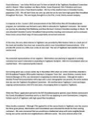
Establishing the Network