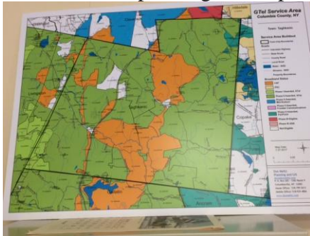
Gtel Dashboard Report for May