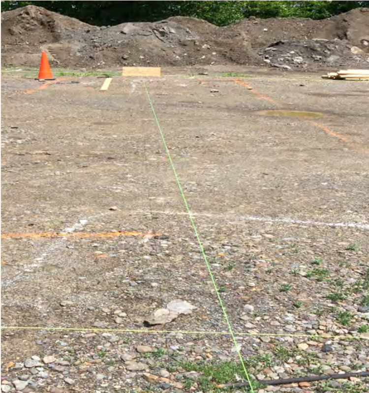
Front of the Shed