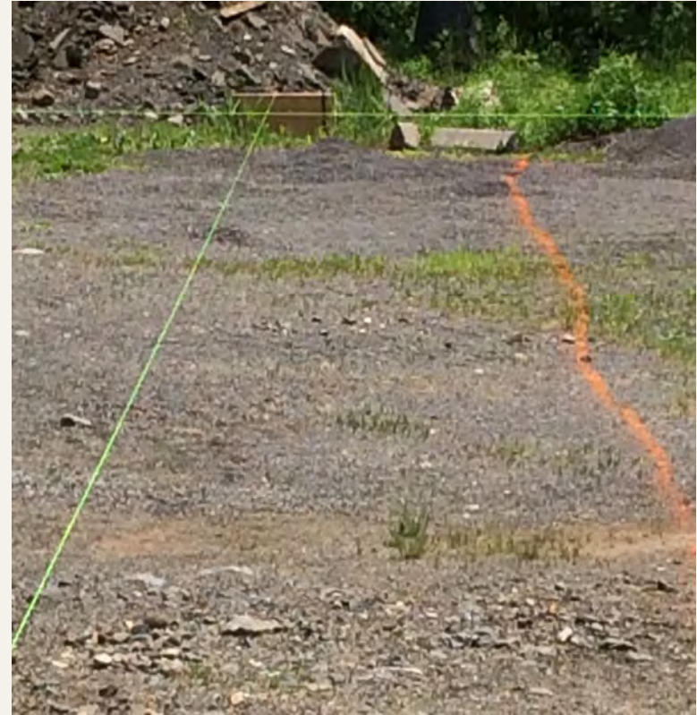
Length of Shed