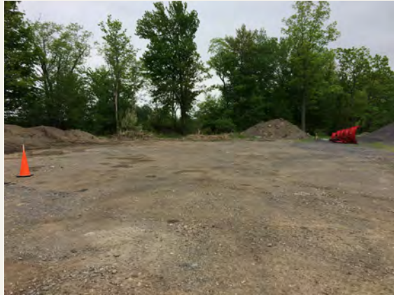
Looking into the shed site